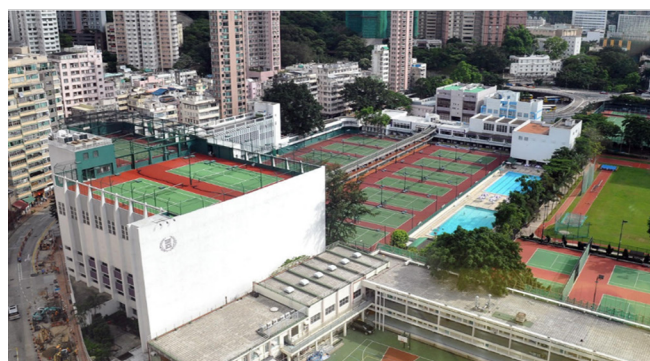
Figure 2. Tennis Courts build up on the roof top of the building. Chinese Recreation Club, Hong Kong.