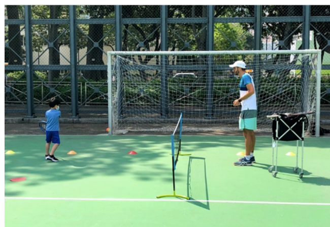
Figure 1. Street tennis. Tennis lessons without a tennis court. Catalasport, Hong Kong.

Also negotiate the possibilities of running other non-racquet sports through your company such as CrossFit, yoga, football, etc.