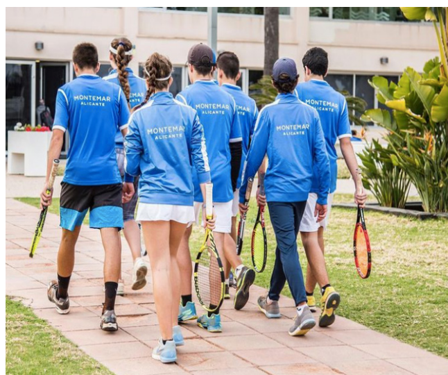
Figure 4. Kids wearing the club's uniform. Club Atletico Montemar, Spain.

Stay updated with the methodologies recommended by the leading tennis organizations in the world. Game-based approach and constraints-led methodology are recommended rather than traditional coaching. Follow the approach of the ITF, National Federations, or some prestigious tennis academy to support the methodology run by your organization. Teach that methodology to your coaches and structure the training programs following those guidelines.