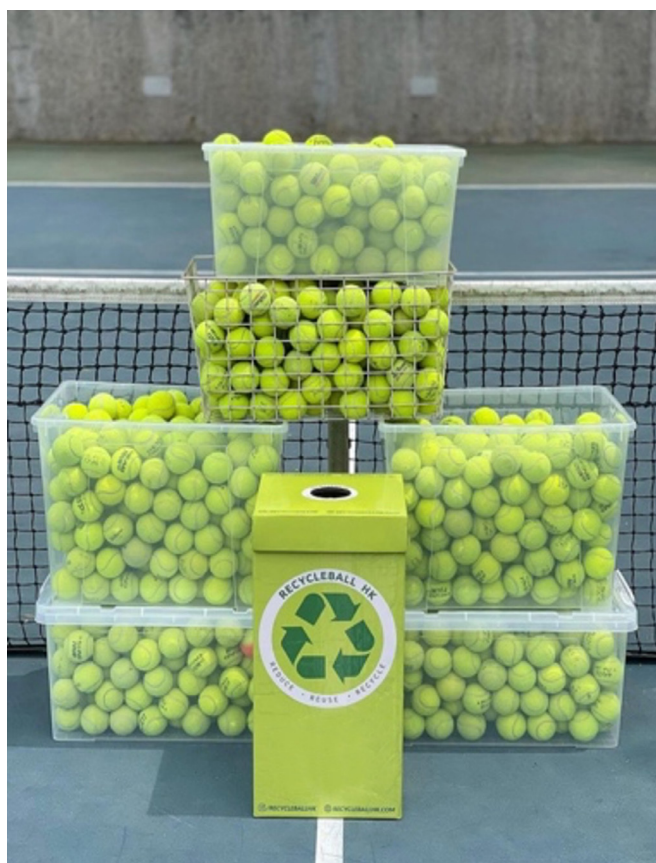
Figure 5. Recycle ball company in Hong Kong. #recycleballhk.